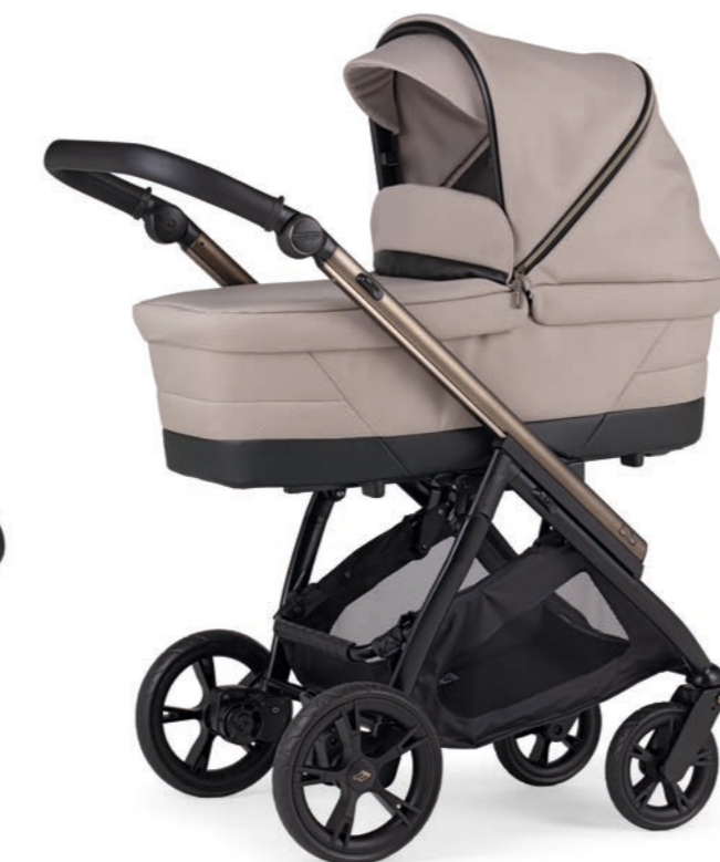
Bib Topo (C505) Mixed mat fumé - black chassis.