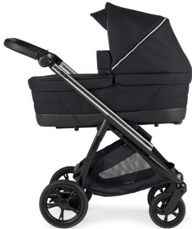
Bib Black (C501) Mixed chrome - black chassis.