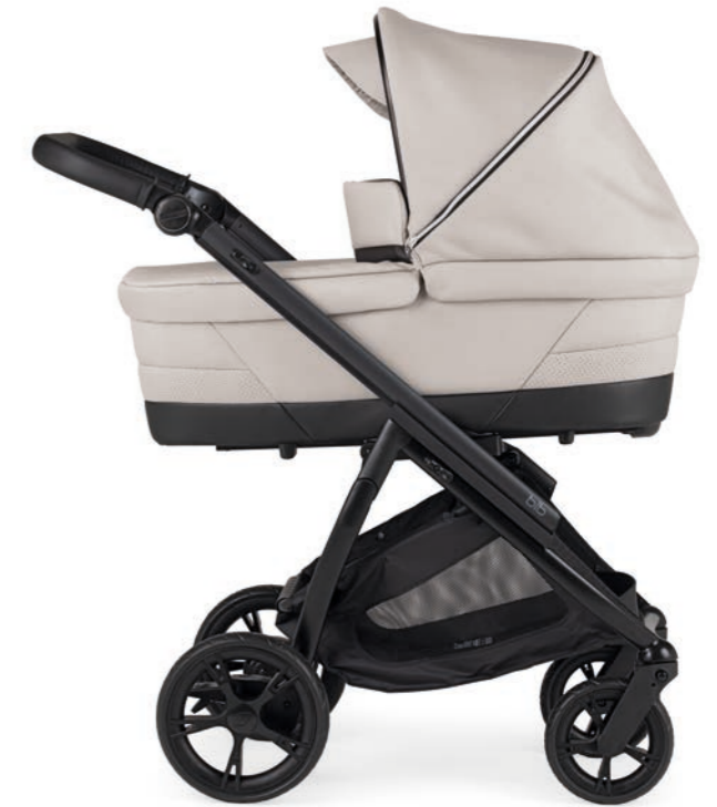
Bib Cream (C504) Mat black chassis.