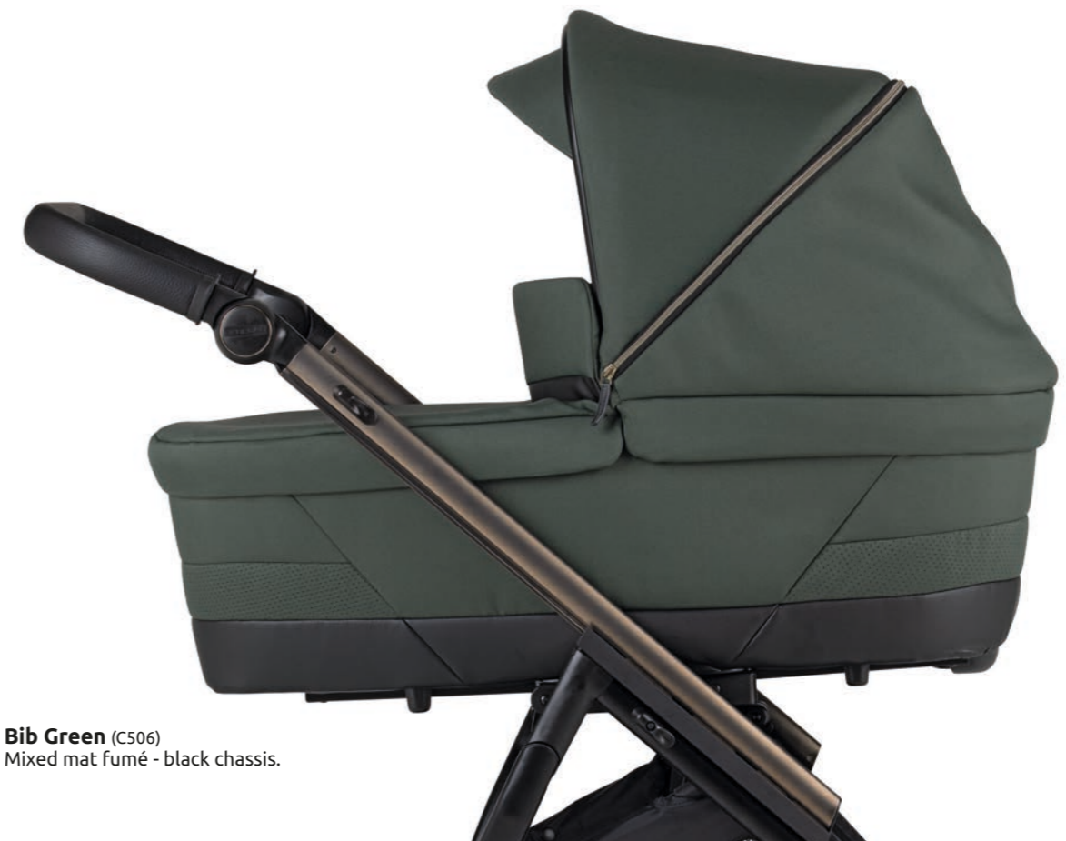
Bib Green (C506) Mixed mat fumé - black chassis.